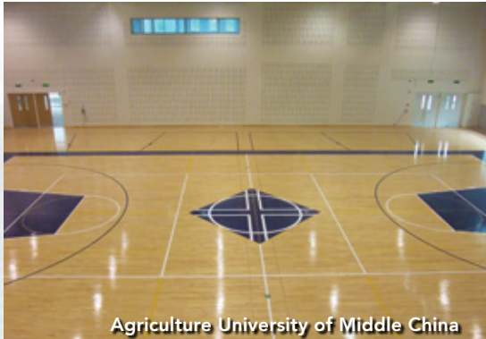
Agriculture University of Middle China