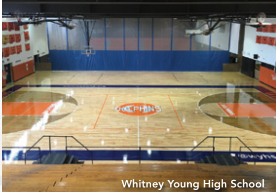
Whitney Young High School