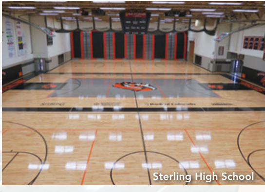
Sterling High School