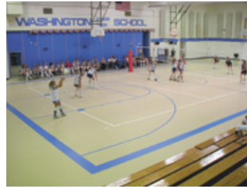
The ultimate in versatility, this polyurethane and rubber sandwich system is terrific for the desired performance and budget.