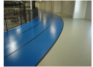
Spike Resistant and High Strength ElastiPlus are also available for track, inline skating, and hockey use.